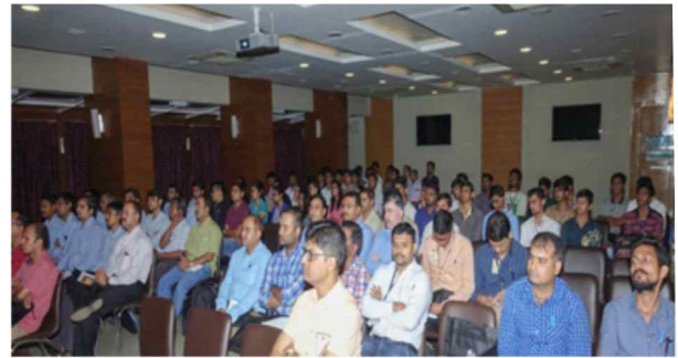
Delegates of Workshop